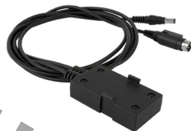
Above: PSU-RPS-5V 12V to 5V converter power adaptor

VSC48: 2m 3-pin locking to 3-pin locking power lead PSU-RPS-5V: 12V to 5V converter power adaptor. 2m PSU-RPS-5V-3M: 12V to 5V converter power adaptor. 3m RMK4D-R2: Rack mount bracket with holder for power adaptor (PSU-RPS-5V) PSU-RED-460W: Additional 460W power module