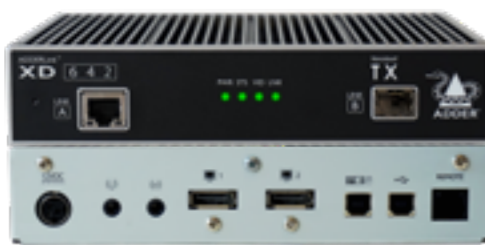
ADDERLink XD642 TX - Front & Rear