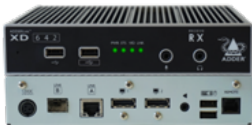
ADDERLink XD642 RX - Front & Rear

SM (Single-Mode Fiber) MM (Multi-Mode Fiber) CAT6 is recommended for CATx extensions. CATx extensions are limited to 2 short patch connections. Patch cables should be CAT6 or better.