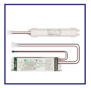
3H DALI Emergency Kit NET-19-33-17