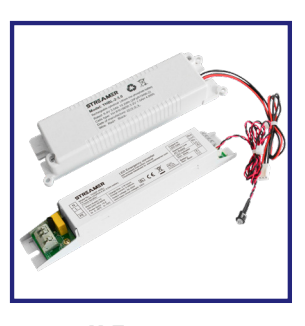
3H Emergency NET-55-33-01